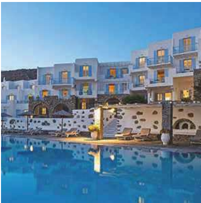
Mykonos: Manoulas Beach Hotel (FC) Agios Ioannis Mykonos, Greece

The Crowne Plaza Athens City Centre is a modern 193 room property, in the heart of Athens' commercial district offering Free Wi-Fi access. The hotel has a choice of dining options including the roof garden restaurant where during summer months, guests can dine under starry skies whilst enjoying a spectacular view of Lycabettus hill. The perfect place to unwind is at the roof-top bar where snacks and drinks can be taken al-fresco in the summer by the refreshing outdoor dipping pool.