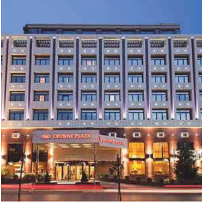
Athens: Crowne Plaza Athens City Centre (SFC) Michalacopoulou Street 50 Athens, Greece

The Crowne Plaza Athens City Centre is a modern 193 room property, in the heart of Athens' commercial district offering Free Wi-Fi access. The hotel has a choice of dining options including the roof garden restaurant where during summer months, guests can dine under starry skies whilst enjoying a spectacular view of Lycabettus hill. The perfect place to unwind is at the roof-top bar where snacks and drinks can be taken al-fresco in the summer by the refreshing outdoor dipping pool.