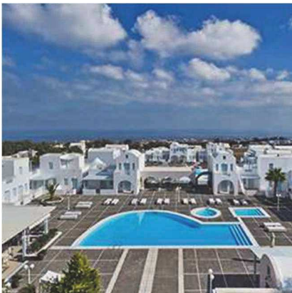
Santorini: El Greco Hotel Apartments (FC) Santorini, Greece

The magnificent view of Agios Ioannis bay and the sacred island of Delos will offer you the warmest welcome when you arrive at Manoulas Beach Hotel.